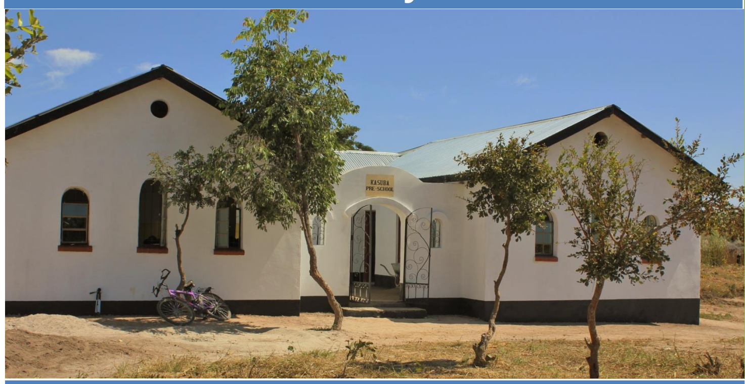
Jan-May Activity Report